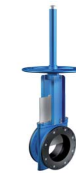
Handwheel with rising stem